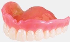
3D Printed Dentures